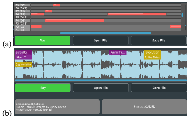
Figure 2. (a) Piano roll for display and playback of MIDI files in HARP. (b) Audio-to-labels in HARP. Labels are displayed in multiple colors to denote audio similarity as detected by different embeddings. Details about the label appear in the bottom left ‘info’ box.

or MIDI models and (3) numerous interface and stability improvements, including a complete overhaul of the application format and Windows/Linux support.